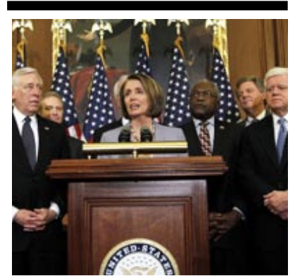
The House of Representatives passed historic health care reform legislation on March 21, 2010.